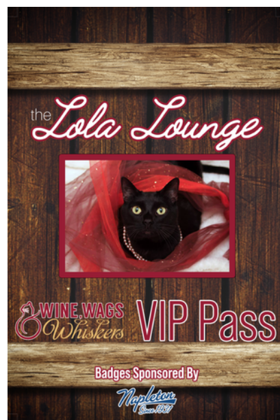
2023 VIP BADGE

Event tickets and VIP Lounge access for 2 guests